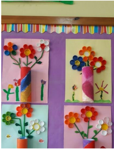
F is for Flower