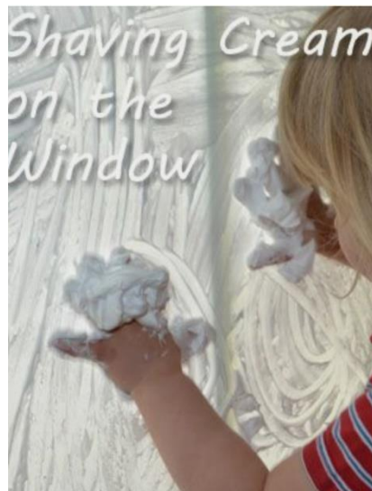
Draw letters in shaving cream on the window or in a pan