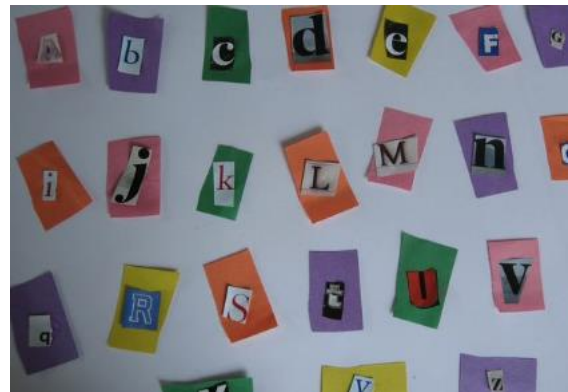
Cut letters out of newspapers or magazines